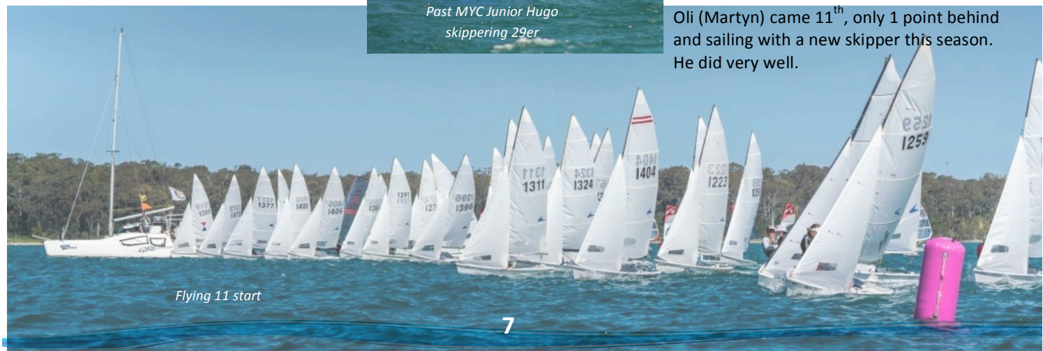
Flying 11 start