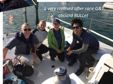
a very civilised after race G&T aboard BULLet

(Apologies ... your editor is reduced to stalking FB pages for content ... this from Esprit FB page)