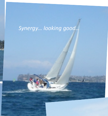
Synergy... looking good...