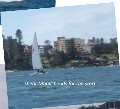
Shear MagiC heads for the start