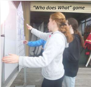
"Who does What" game

We looked at one of the Training videos that are on our web-site: www.manlysailability.com.au , and talked about the other videos that are available, and why people should take the time to have a look, and train themselves in rigging, using the hoist, and taking important roles.