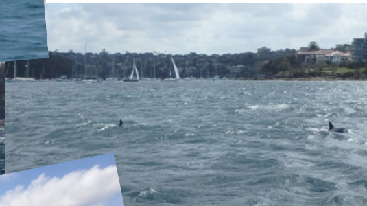
San Toy opts to head back to the marina with the dolphins...

Esprit was feeling stalked by BULLet on Sunday's Summer Series Race 2 but big smiles as we stayed ahead of them! (OK we both came last and second last on handicap, but at least Esprit came not-last!).