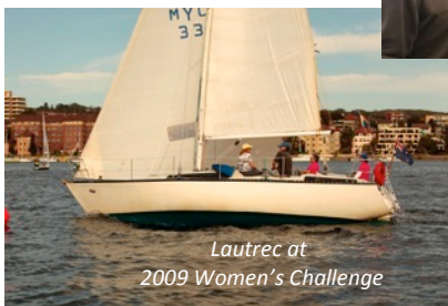
Lautrec at 2009 Women's Challenge