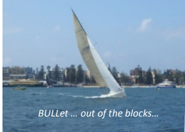
BULLet ... out of the blocks...