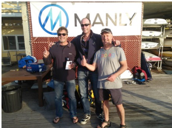
The "Granklins"... happy winners by just 2 points over the "Daceys" in the first Mini Regatta.

Last Sunday's 4P and SPS races were sensibly abandoned due to a 30 knot sou-westerly.