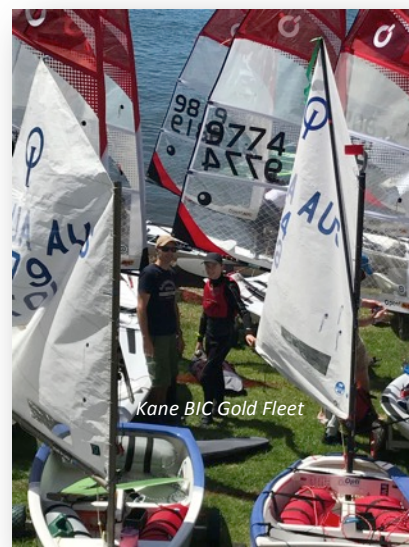
Kane BIC Gold Fleet

Unfortunately didn't manage to get the MYC crew together as we were spread out over the boat park.